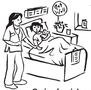
Caring for sick people