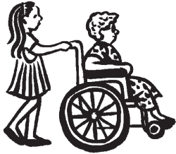
Helping the elderly