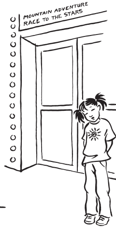
Skipping church to go see a movie

In different faith traditions, All Saints Day can be called different names. Circle all the names you think All Saints Day could also be called.